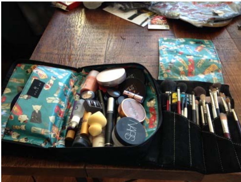
Voila! Everything fits and is super easy to find.

A few other things to note: The bag comes in several adorable patterns. Of course I chose the cute little Endochine Kitten Dolls because I'm a huge cat lover. All the bags have black “Knew Suede” exteriors because it's super easy to clean (which I have tested and proven several times because I'm a slob) and tie up into a flat, easily packable package.