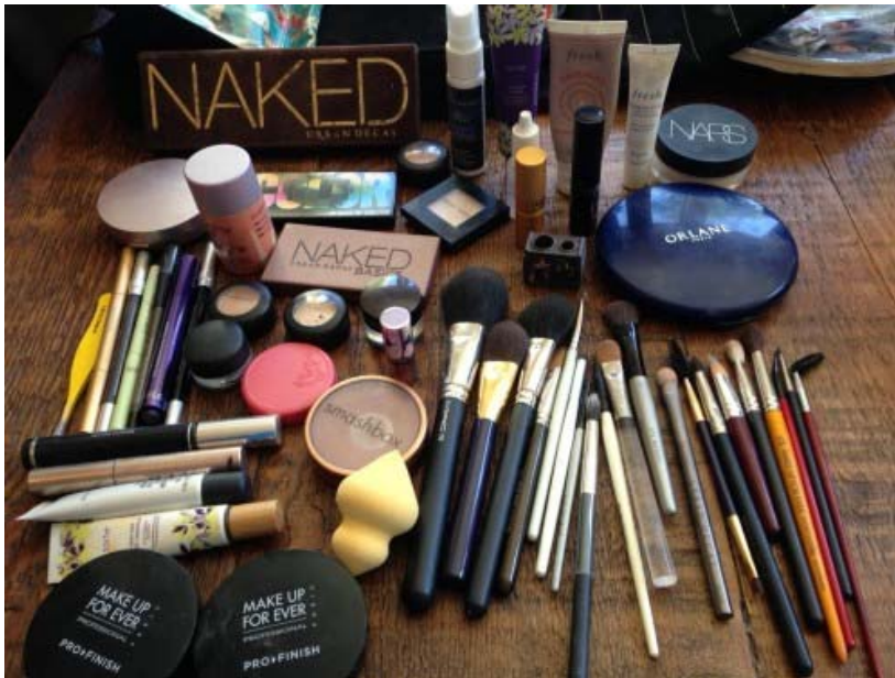
All the products I'll bring on my 2-day trip

Let's face it — you buy those makeup bags with compartments so you can “get organized” but you never end up putting the products back in their original place. And, the compartments take up so much space diving the bag that you can only get a fraction of products in a large makeup bag. Drove me crazy! So below you can see my chaos I bring on every trip these days and how the Hold Me bag does in fact hold it all!