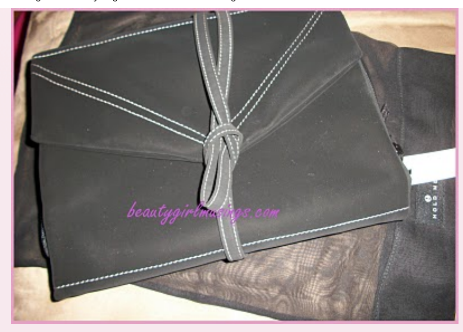
meet the Hold Me bag. isn't the wrap-a-round, vintage schoolgirl's book-bag look so adorable?