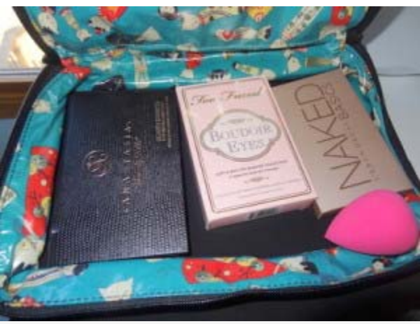
Hold Me center barely filled yet holding 6 palettes

The Hold Me Bags come in 2 sizes (original and baby) and lots of great patterns inside. It brings a smile just to open this bag. This particular size measures 10"H x 7"W x 2"D closed and extends to 22" fully opened. It has room for 15 brushes (though you can get even more in if you have some super skinny ones). The big pocket area holds an amazing amount of cosmetics. My picture shows just a fraction of what I could take.