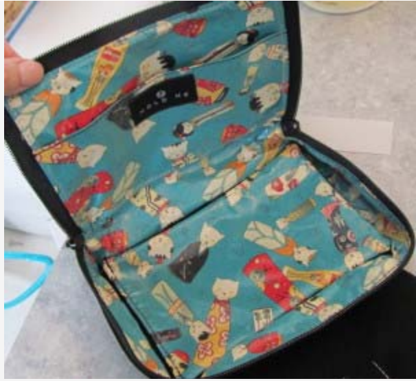
zippered compartment open, the extra liner is on the bottom

The center section expands and holds quite a bit. When I went on my trip, I had two foundations, one concealer, a loose powder, two cream blushes, two powder blushes, three eyeliners, brow powder, and my small Z Palette.