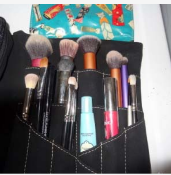
Hold Me bag brush section