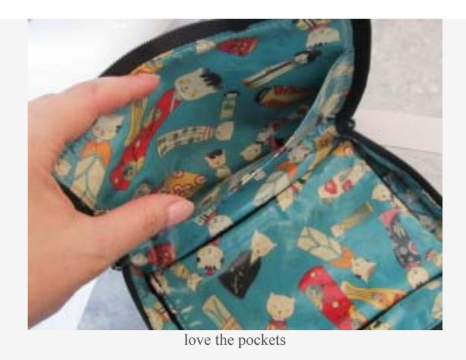
The Baby Bag is perfect for so many things – you can fill it with your essentials and keep it in your vanity or bathroom drawer. It's a perfect size for keeping at your desk at work for daytime touch-ups. It's even small enough to fit into a medium size purse. And of course it's fantastic for travel. Do you need this bag? YES.

The center section expands and holds quite a bit. When I went on my trip, I had two foundations, one concealer, a loose powder, two cream blushes, two powder blushes, three eyeliners, brow powder, and my small Z Palette.