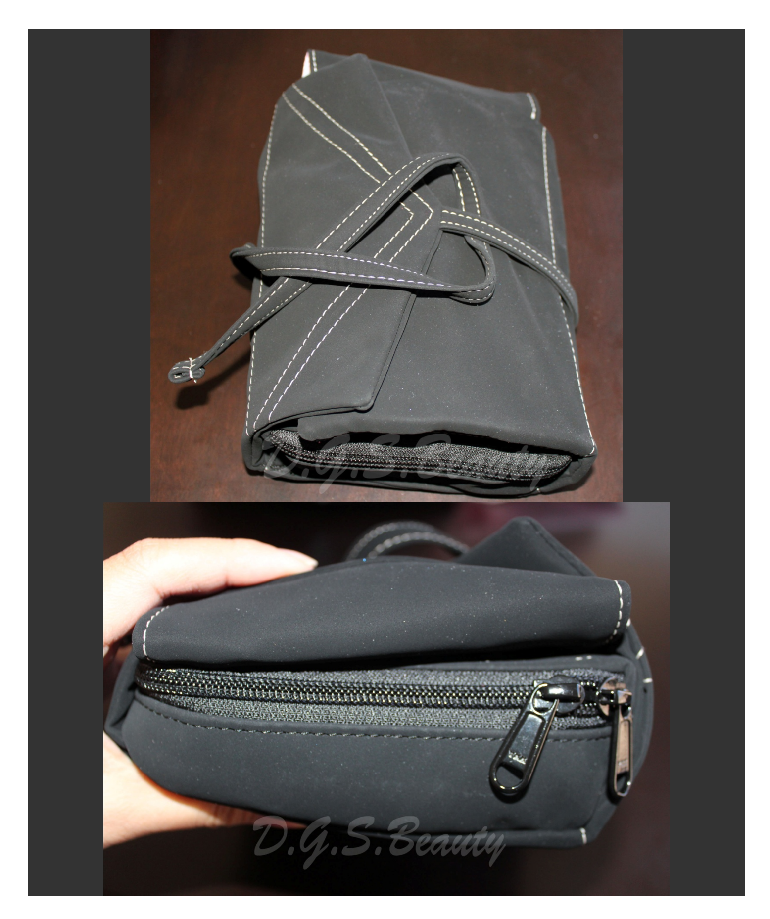
Page 6 of 7