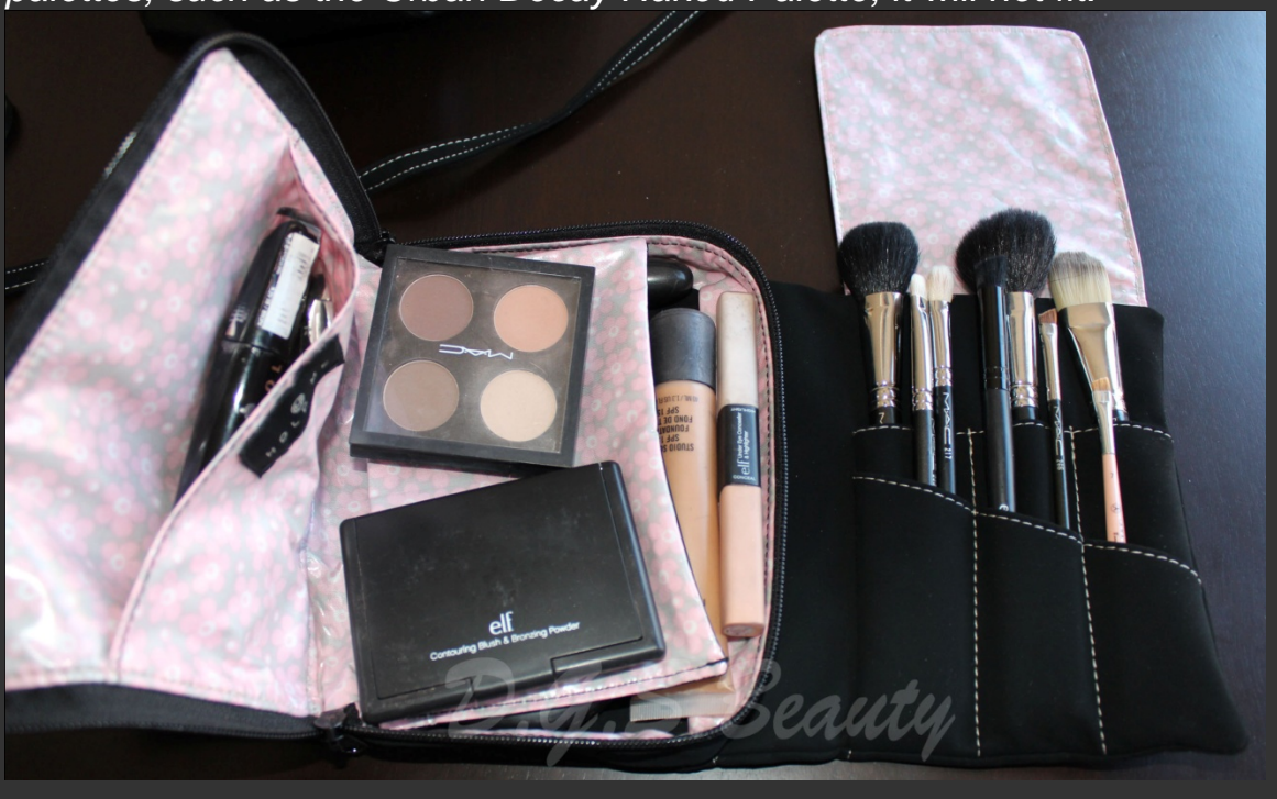
Page 3 of 7