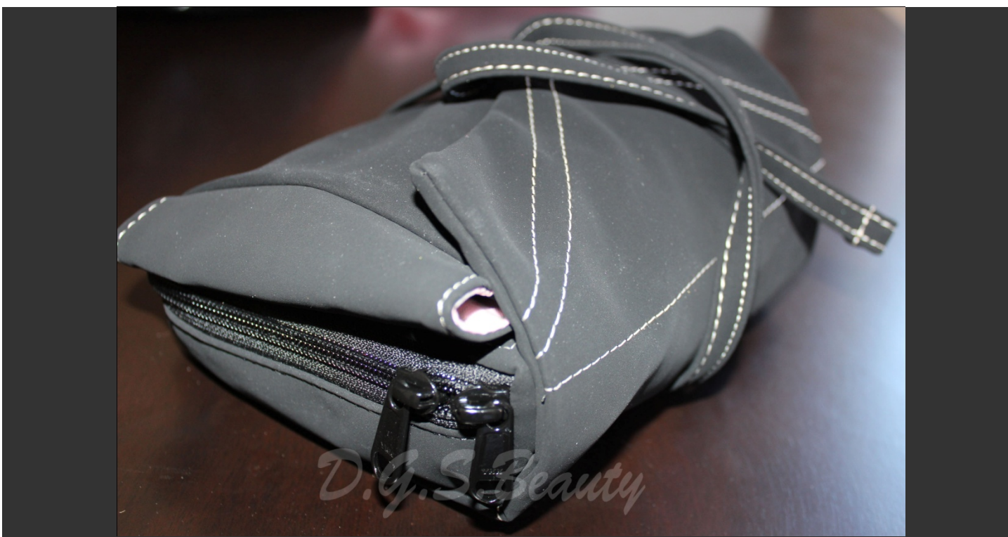
If you also travel light with makeup, the Hold Me Baby Bags would be perfect for you, which retails at $55.00. However, if you prefer having more makeup with you, the regular size Hold Me Bags is also great for $85.00