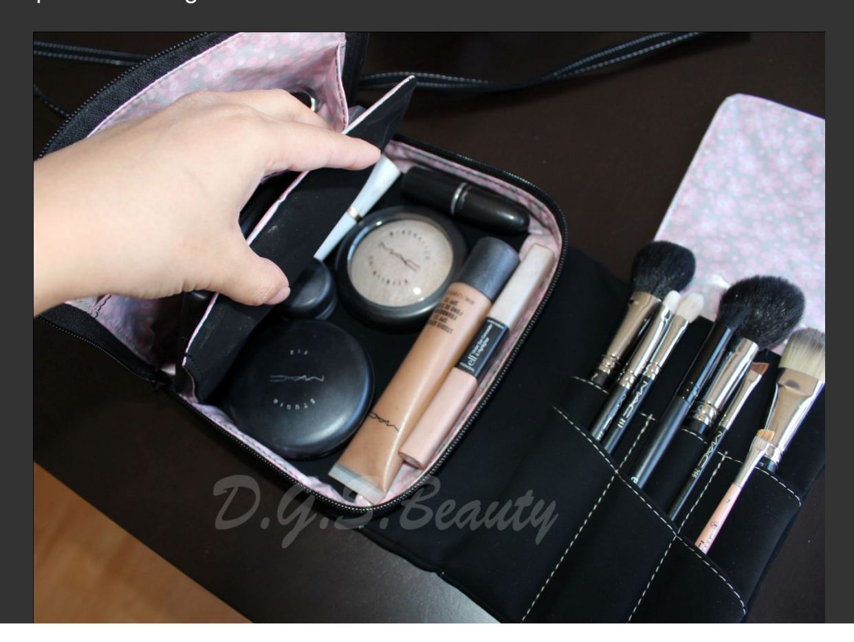
Page 4 of 7

Original patented design. Handmade in the USA.