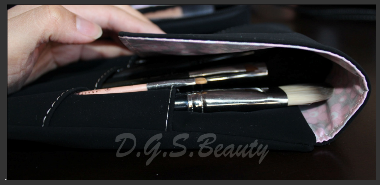
Everything packed and ready to go.

I do not have much travel size brushes, so as you can see my full size face brushes are a bit tall for the brush holder section, but I managed to make it work.