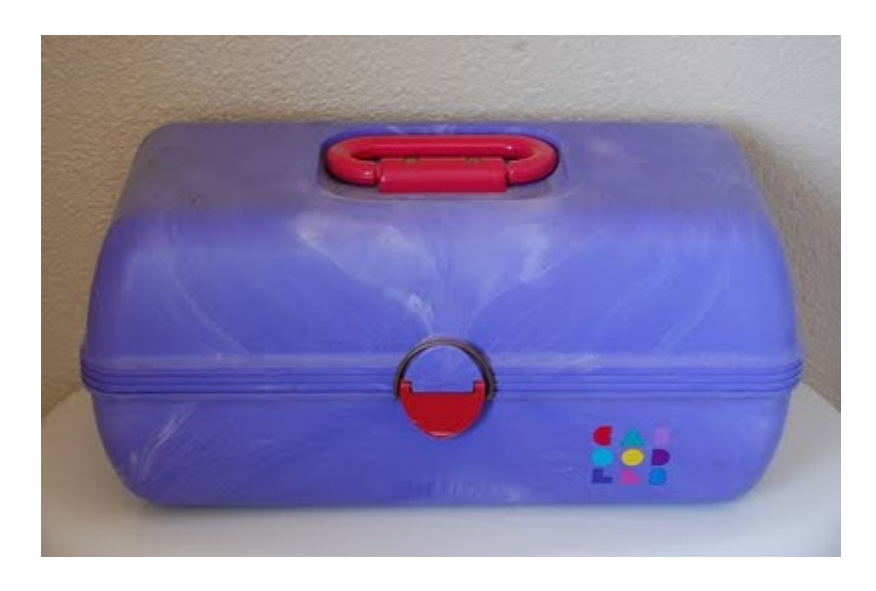
(While this isn't my exact Caboodle, it is the exact one I owned!)

Every makeup lover I know has followed the same kind of makeup-loving path. You start by picking a few things up at the drugstore, along with a little makeup bag. Soon, you graduate to a Caboodle, which seems to have endless space. Sooner or later, the once-so-large Caboodle now pales in size and you consider a Train Case. The price tag probably threw you off and you realized that a tool box (or fishing tackle box) was a much better option and you hit the Home Depot. Here is where some women stop the journey. Not me, though. I looked into a Lori Grenier wooden mega-cabinet and settled on the Lowe's Machinist Chest, which I've also outgrown. Let's be honest, I have a small room that is full of makeup and quickly running out of space.