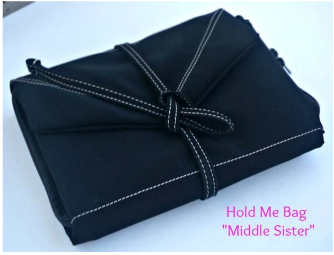
Hold Me Bags fold up to look just like a stylish clutch.

I filled my Middle Sister bag with the cosmetics and beauty tools I use the most. I even have room to spare! I'm so glad I got my things organized into one place – now I don't have to dig around in my makeup drawers looking for my favorite color eye shadow every morning. It's right there in the expandable, zippered middle section of the bag.