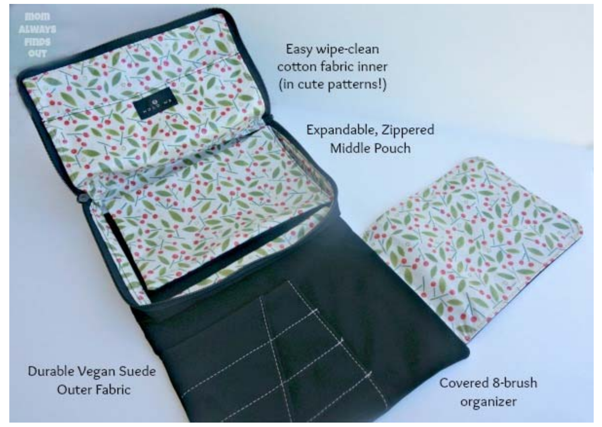
Middle Sister bag features.

I love how easily the Hold Me Bag unfolds and lays out flat. The inside features a cute cotton print. In addition to the zippered middle section, there are eight brush holders that I use for my makeup brushes, lip pencils and eyeliners. I can even stuff the Middle Sister a bit fuller if I need to, thanks to the schoolgirl-type tie closure. It's very forgiving if I need to pack a bulging makeup bag!