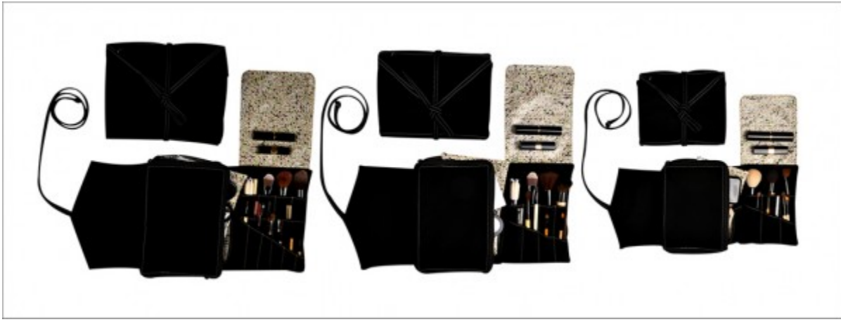
Hold Me Bags Collection includes 3 sizes: Little Sister, Middle Sister and Big Sister.

The next part came out really fast for him, "...But, do you really need ALL of your beauty stuff out at the same time?" I took a look at my side of the bathroom counter and saw his point. Lipsticks, brushes, compacts, mascaras, and all my beloved beauty tools were getting a little out of control. It was definitely time for me to go through them, get organized, and clear the clutter.